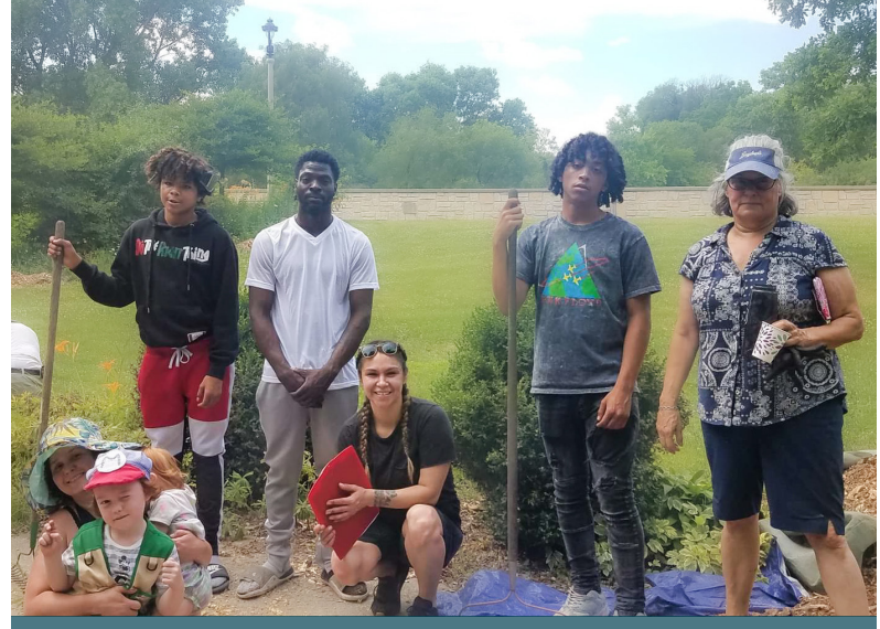
Neighborhood families taking a group photo after an afternoon of volunteering through Friends of Valley Park.

Our southern border is I-94. West of us is the Menomonee River. North of us is the MillerCoors plant. This means our streets are almost all dead ends. It's a quiet little corner that many in the city don't know about. I meet residents all the time who say they chose to live here to shelter their family from the struggles many Milwaukeeans face due to deindustrialization, redlining, white flight and other systemic barriers. Also, near and dear to my heart is that it's one of the most diverse neighborhoods in Milwaukee, a city infamous for its segregation. In the 2010 census, our neighborhood demographics were 36% Black, 34% white, 16% Latino and 11% Asian. At its best, our neighborhood is a peaceful, joyful place where kids and families across racial identities and the