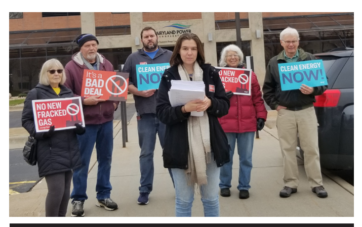
Leaders of the Coulee Region Group deliver petitions in opposition to the NTEC gas plant to Dairyland.

Fracked gas (commonly known as natural gas, though there is nothing "natural" about it) has been touted as the "bridge fuel" for clean energy. However, there is nothing clean about the environmental damage and degradation caused by fracked gas. Like other fossil fuels, fracked gas emits carbon dioxide and methane, another potent greenhouse gas, into our environment. Fracked gas energy production is also a waterintensive process, and its dirty water continues to pollute our environment and endanger our health. As defenders of our environment and communities, we are actively working against the use of fracked gas in Wisconsin.