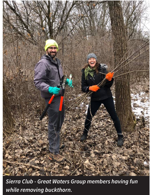
Sierra Club - Great Waters Group members having fun while removing buckthorn.

However, for many the dream of visiting public lands remains elusive, particularly for Communities of Color and low-income communities. An analysis by the Center for American Progress and Conservation Science Partners discovered that these communities have less access to open space and natural areas than the rest of the population. Key barriers that exist include lack of information or gear and financial or transportation difficulties. While this is a national issue, Wisconsin also faces similar problems of public park access. About 40 percent of the United States is public land. For Wisconsin, that number drops to 17 percent, with a large