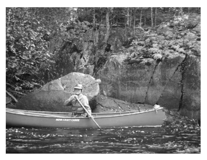
On his 44th trip he joined the SC River Touring Section on the Pike, where this picture was taken {shown above}. Paddling the Pine on a sunny day in December brought paddlers from all surrounding states and Canada to join him on this special 50th river trip.

The Wisconsin system of state Wild Rivers was established by the 1965 Legislature in order to afford the people of the state an opportunity to enjoy natural streams, to attract out-of-state visitors and assure the well-being of our tourist industry, and to preserve some rivers in a free flowing condition and protect them from development. In 2015, paddlers from the Sierra Club-John Muir Chapter celebrated the 50th anniversary of the act, which the Sierra Club was instrumental in passing.