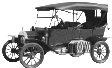
Model T: 25 mpg