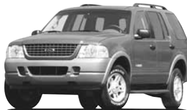
Explorer: 16 mpg

Nearly a century ago, Ford's Model T got 25 miles to the gallon. Today, Ford's cars and trucks average 22.6 miles per gallon, and the Explorer gets just 16 miles per gallon. That's not progress.