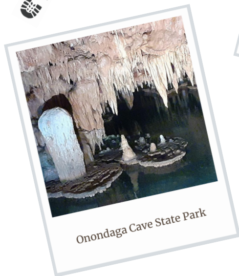
Onondaga Cave State Park