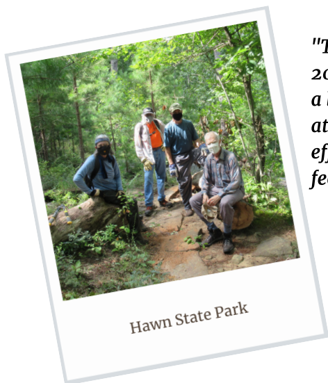
Hawn State Park

"This is my favorite photo from 2020. We had just got done clearing a large tree that was blocking a trail at Hawn State Park. It was a team effort, and I remember the good feeling I had for a job well done."