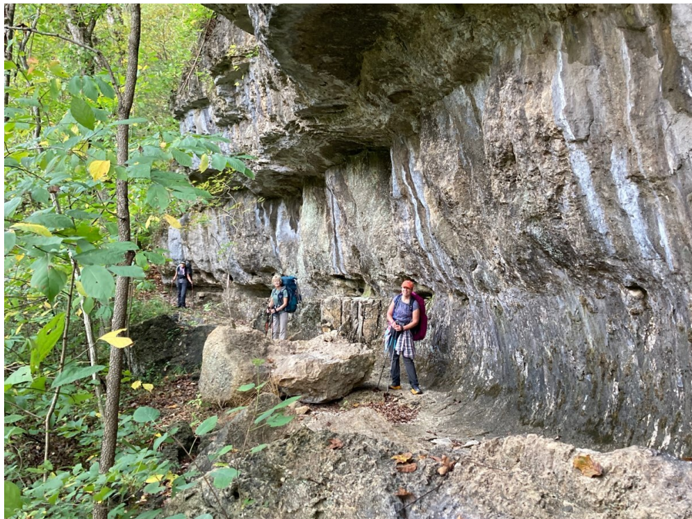
Backpackers on the Upper Current Section of the Ozark Trail.