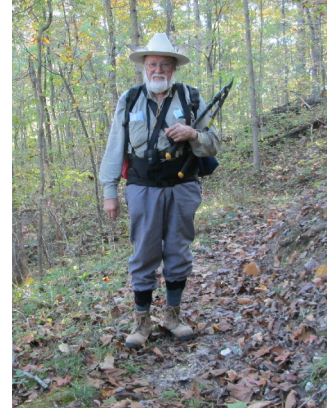
Trail Week 2021 in Current River State Park.

Hawn State Park is my favorite place to hike in Missouri. The people who visit Hawn treat it well. My favorite place outside Missouri is Yellowstone National Park. I have made 3 trips there and would like to do one more.