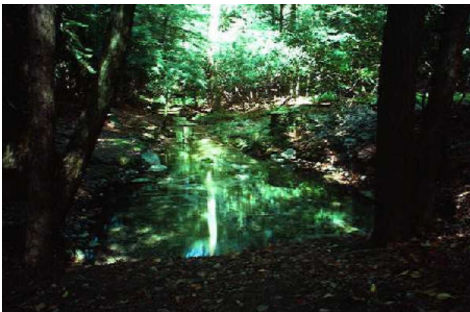
Trout Run's luscious sand springs.

Taxpayers recently invested over $6 million in state and federal grants and millions of dollars in state issued low-interest loans to develop the SEEDCO industrial park in Coal Township where Reinhart Foods is now located. To date, Reinhart Foods is the