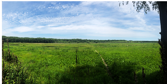
Photos taken by Veronica Bauer at the Indiana Dunes National Park ( www.indianadunes.com ) during summer 2020.