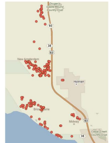
Nitrate > 10 mcg/mL Spring 2017

Watch for more details in our December newsletter. In the meantime, if you have a private well, get it tested! And view handouts, maps, and other forum materials at cr-sierra.blogspot.com/p/groundwater-pollution-forum-october-24.html